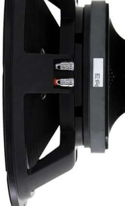
Pro-X15-8 (non-long stroke woofer)

• Active woofer unit should preferably have a resonance frequency (FS) of 30Hz or less and not more than 35 HZ. This data can be found in the woofers datasheet. The technical term is called- FS / Fs or F0 but it can also be listed as the resonance frequency or free air resonance or just resonance.