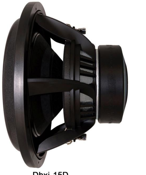
Dbxi-15D (long stroke woofer)